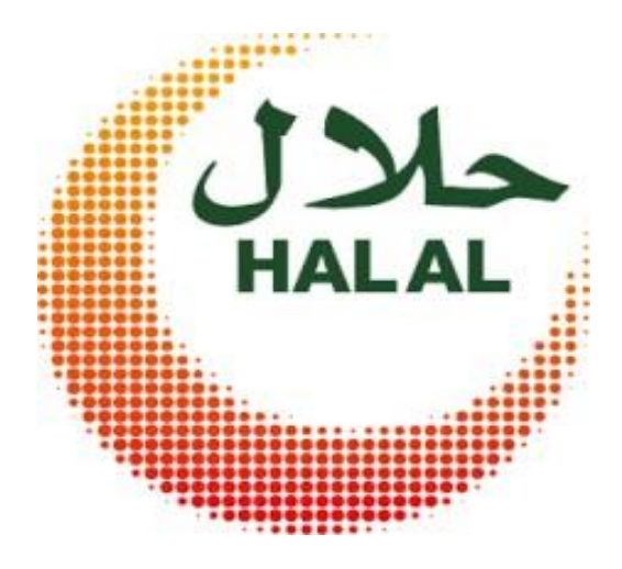
UAE Halal Logo