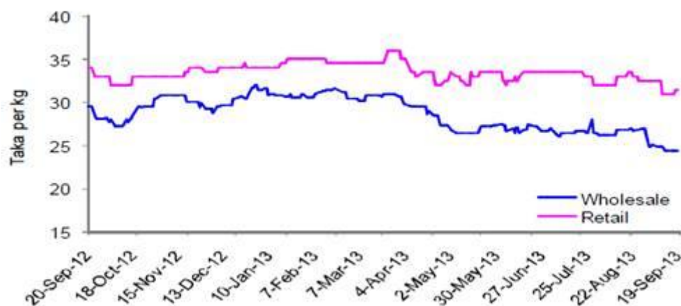
Figure 2. Bangladesh: Trends of Coarse Wheat Flour Prices in Dhaka