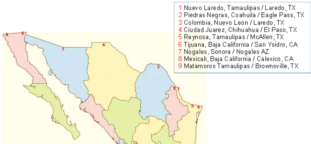
Fig. 1 Geographical location of the Principal Ports of Entry for US Agricultural and Food Products ranked by order of importance.

The reader should be aware that live animals destined for Mexico are always inspected on the U.S. side of the border at state-owned or privately -owned livestock pens authorized by SENASICA. On the other hand, Mexico’s Animal Health Law requires that imported animal products and animal by-products, for human and animal consumption be inspected upon entry to Mexican territory at verification and inspection points located on the Mexican side of the border. As of this date, other agricultural products like fresh fruits and vegetables, propagating material, cotton and grains (not transported by rail) are normally inspected on the U.S. side of the border, but can also be inspected at approved VIPs on the Mexican side of the border. Having said that, SENASICA is working towards closing VIP’s on the US side of the border for plant and plant products. As these happen, ATO/Monterrey will be issuing periodic updates.