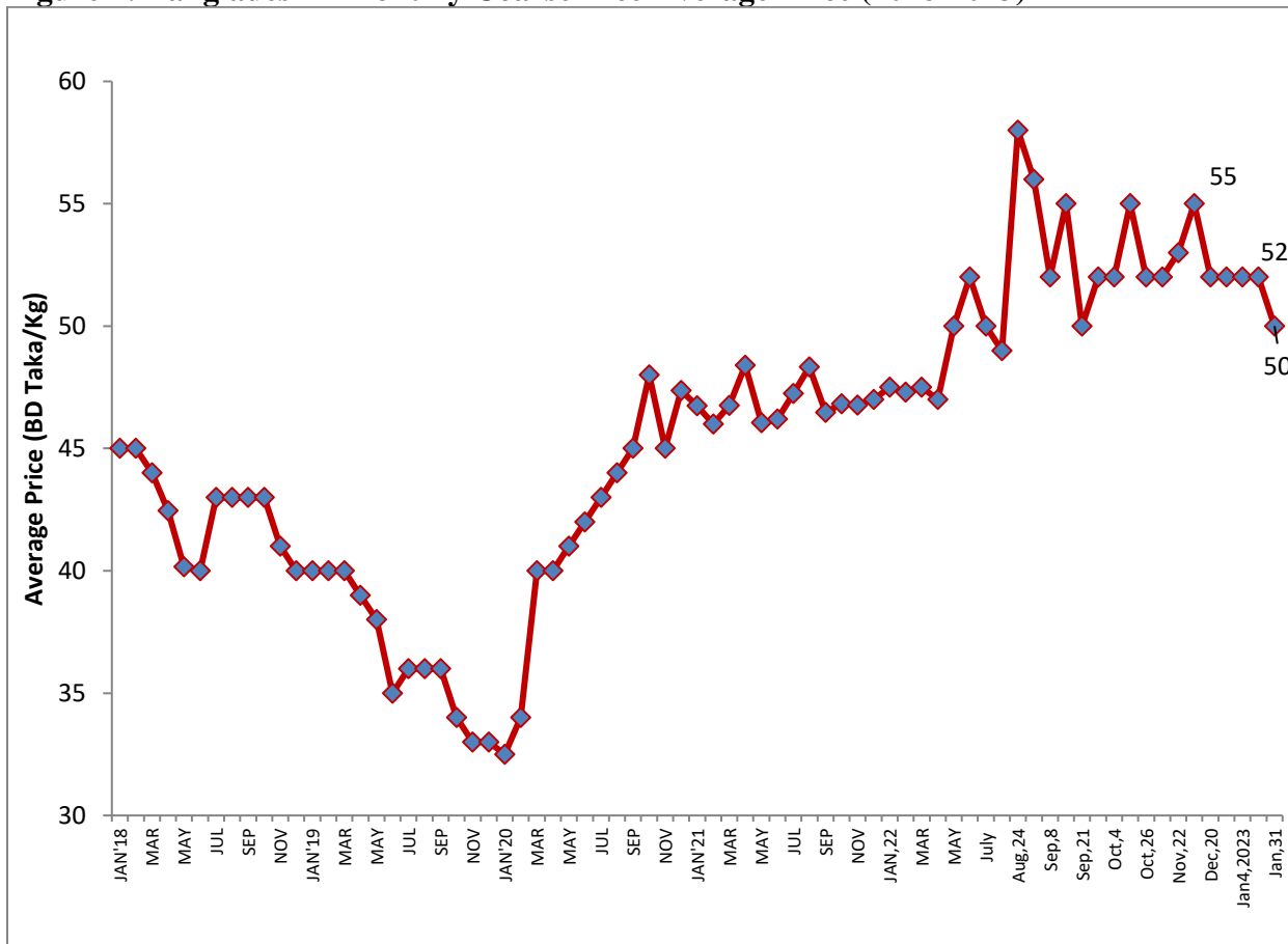
Figure 1: Bangladesh – Monthly Coarse Rice Average Price (2018-2023)

Source: Trading Corporation of Bangladesh (TCB)