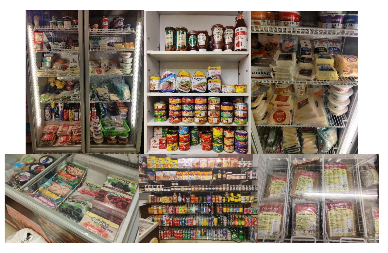
Image 2: International Food Products at Multiple Retail Stores in Ahmedabad

The most popular international cuisines that Gujaratis love to indulge in are Italian, Mexican, Thai, Malaysian, Chinese, and American. They prefer these cuisines with a local taste that is sweet and tangy. Ahmedabad, Surat, and Vadodara are also experiencing a steady growth in coffee culture, which also provides an opportunity for foreign ingredients and snack foods.