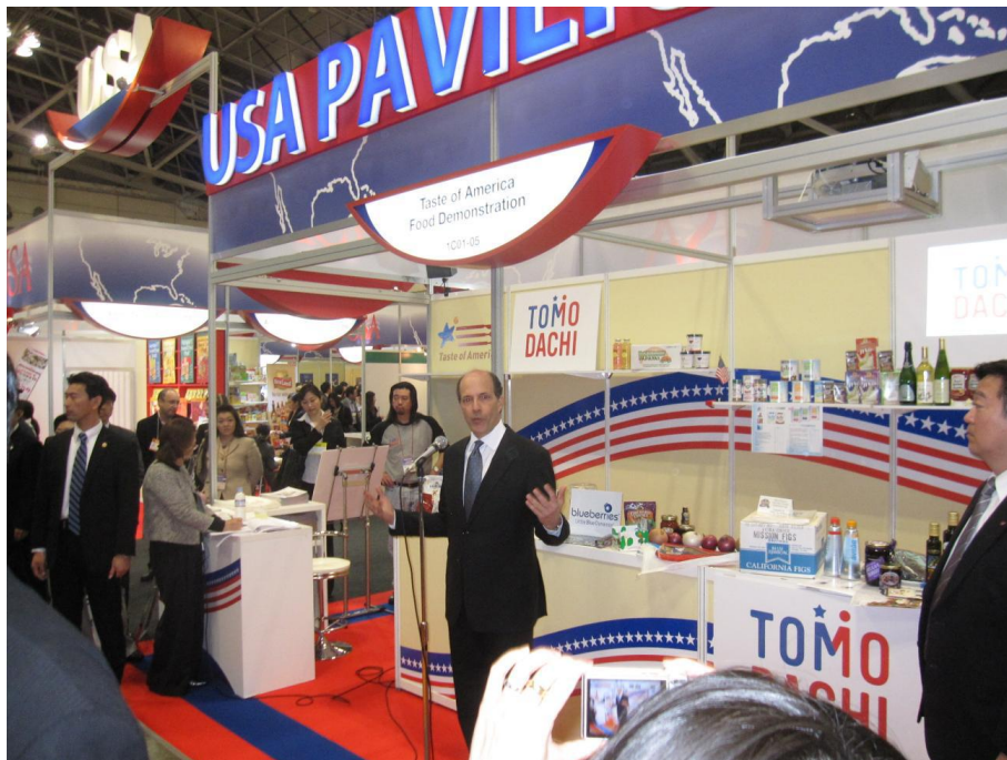
Ambassador Roos in front of Food Demonstration Booth

Twelve groups participated at the Food Demonstration Booth; each participant had a demonstration time of 30 minutes and a 15 minute break to set up. See Appendix 2 for schedule board.