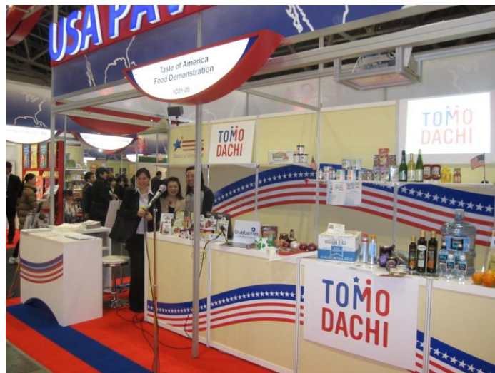
Display of cooperator and exhibitor products

Other cooperators such as American Artisan Cheese sampled several cheeses on top of tacos to create taco pizzas.