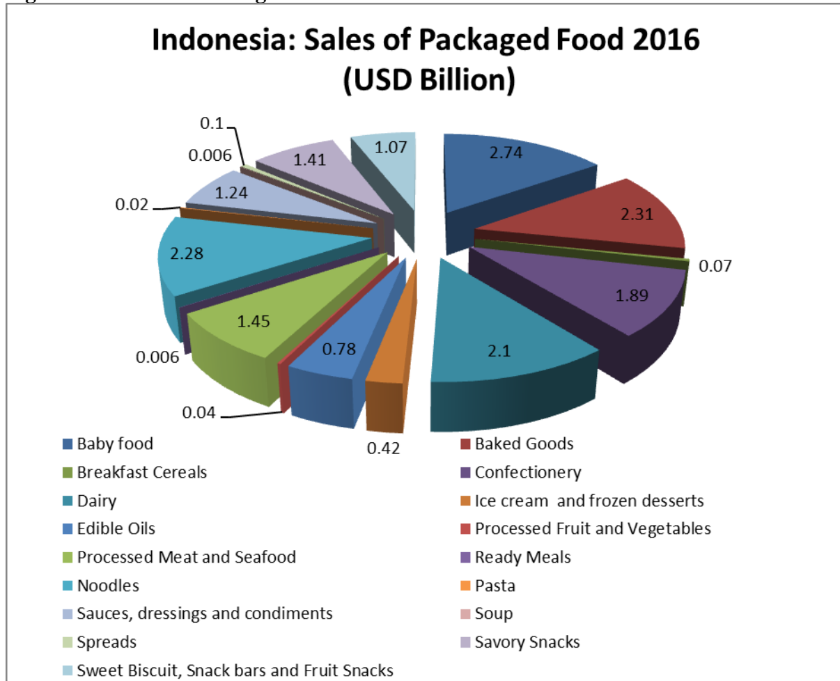
Figure2. Indonesia: Packaged Food 2016