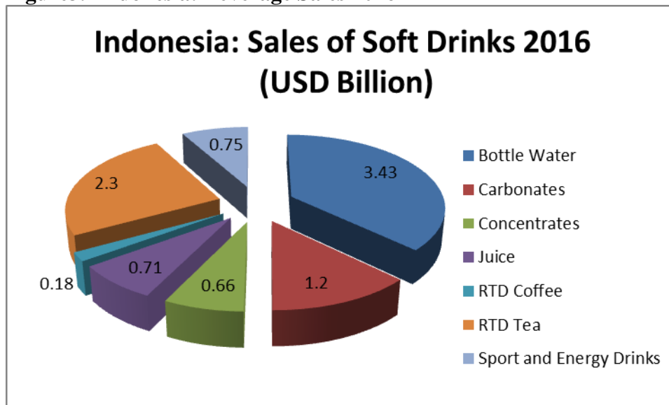
Figure3. Indonesia: Beverage Sales 2016