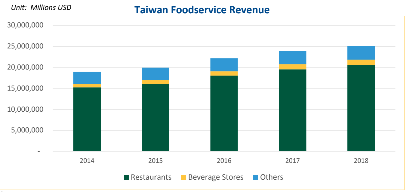
<sup>1</sup>MOEA modified its foodservice survey pool in 2019 to include stores traditionally categorized in other business sectors, resulting in a massive increase in overall foodservice revenue.

According to the Ministry of Economic Affairs (MOEA), the economic output of Taiwan's foodservice sector (excluding institutional food service) was estimated at $25.3 billion in 2018<sup>1</sup>, a 5.4 percent increase from 2017. The foodservice sector has enjoyed stable growth over the past decade with tourism development cited as a primary driver. Other factors such as the rise of consumer income, smaller family sizes, a growing number of working women, and the growth of e-commerce have helped the foodservice sector grow.