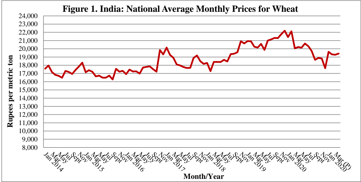
Source: AgMarketNet, Ministry of Agriculture and Farmers Welfare, FAS New Delhi office research.

Wheat market prices are anticipated to hover around the government's MSP prices through the procurement season (ending July 2021). Domestic wheat price movements after July will largely depend on the government's wheat supply, as well as export demand based on international price movements.