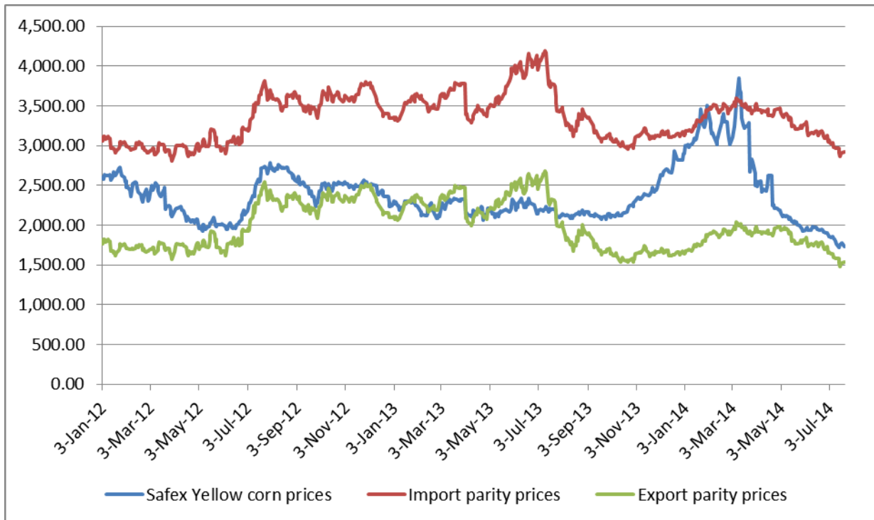
Figure 2: The trend in the SAFEX price for yellow corn since January 2012