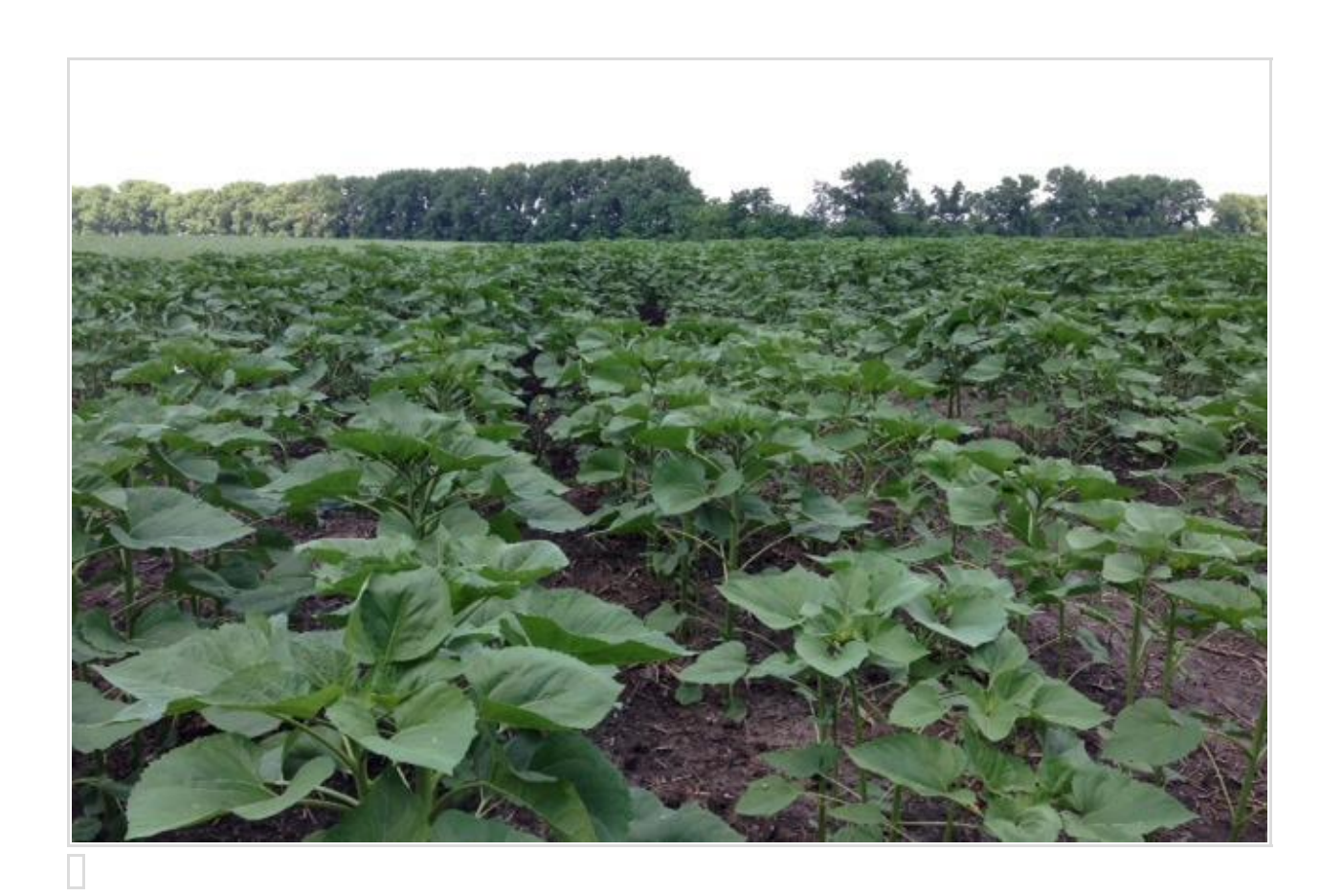
Soybeans also looked green and have been showing the very first stages of flowering.