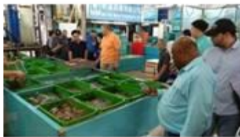
Visit Wholesale Market