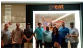
Visit Food Retail Market