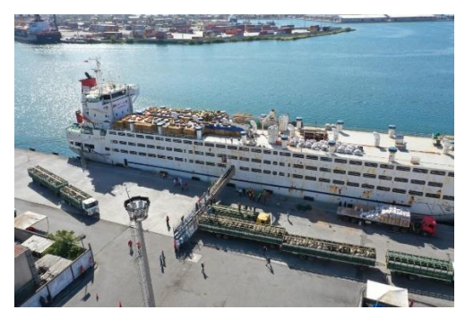
First Venezuelan Live Cattle Exports to Iraq from Puerto Cabello in September 2020.