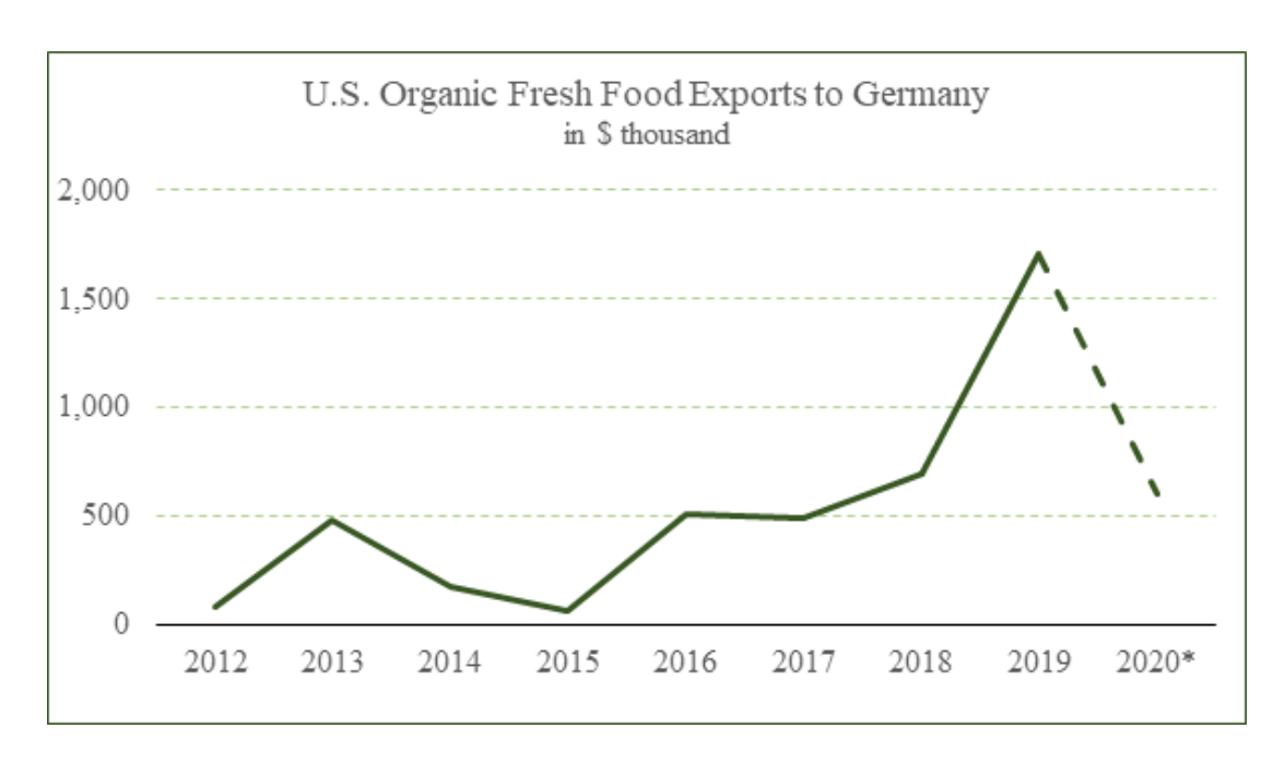
Source: U.S. Census Bureau Trade Data (USDA's Global Agricultural Trade System Online – GATS), 2020* FAS Berlin Estimate

U.S. Census Bureau Trade Data shows very volatile U.S. organic food exports to Germany. The top export product changes every year, indicating that decisions are based on the current U.S. price and supply situation rather than long-term, established contracts between American and German companies. Only exports of organic lemons and coffee show somewhat steady numbers from year to year. In 2017, berries and beets ranked as top exports, while asparagus and coffee led in 2018. In 2019, berries and strawberries topped exports.