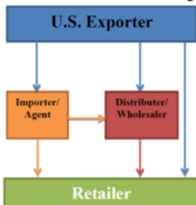
Distribution Channel Flow Diagram

Large supermarket chains import directly, as well as buy from importers or wholesalers. Others usually buy only through importers or wholesalers. In addition to large supermarket chains, which import directly, there are about 300 importers.