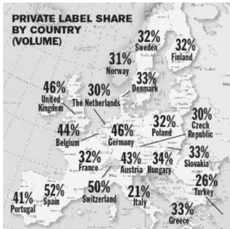
Picture 1. The Private Label Market Shares

The market share of private label is high in retail markets; these markets are highly consolidated and innovative. Several retailers in the Netherlands market have developed two private labels; one focusing on price and the other on enhancing quality. Consumers are discovering the good value for money that private label brands are offering; they can be a good alternative for A-branded products.