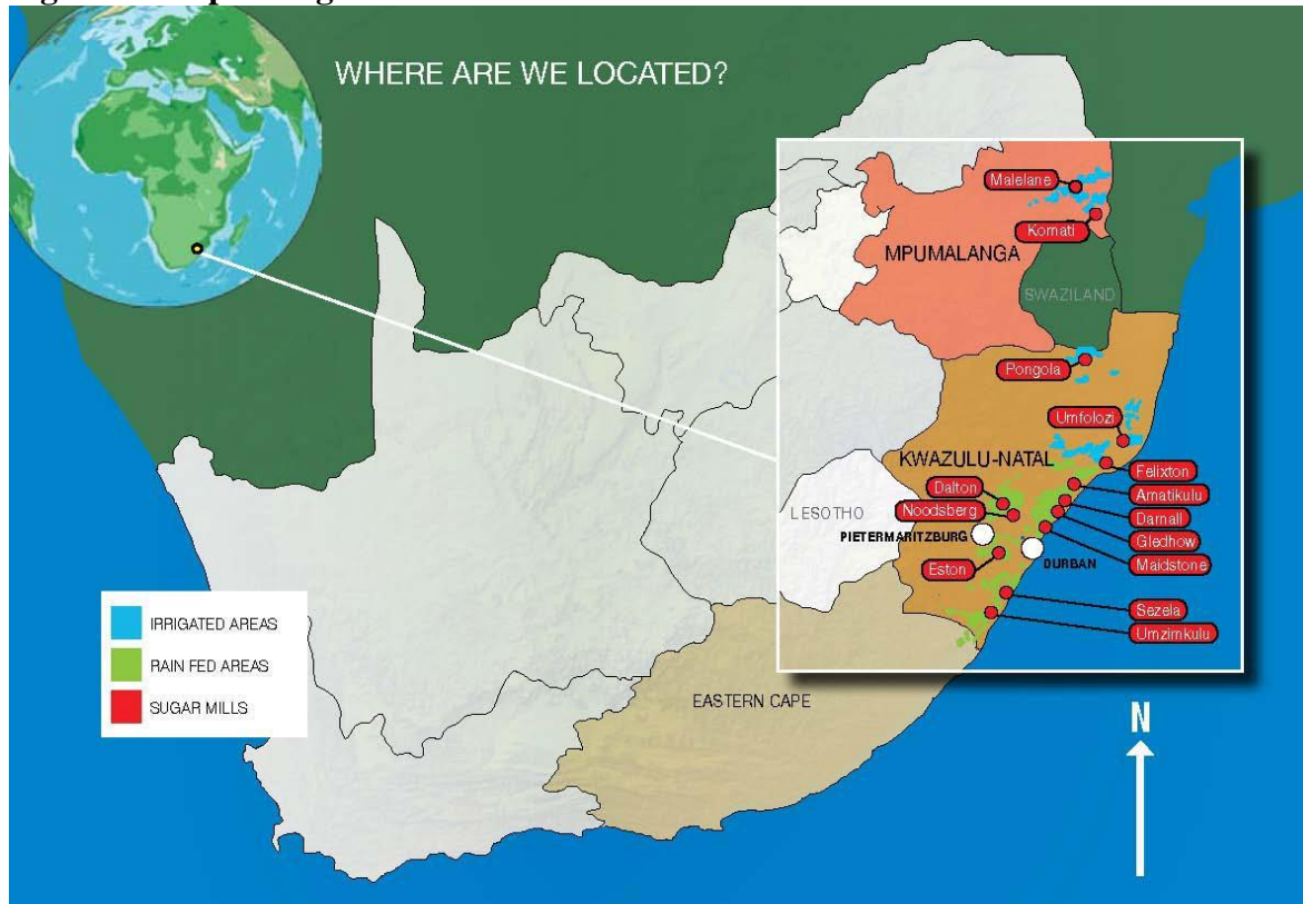
Figure 1: Map of Sugarcane Production Areas in South Africa

Sugar cane in South Africa is grown in the Kwa-Zulu Natal Province and Mpumalanga Province as shown in Figure 1 below. Sugar cane production in the Kwa-Zulu Natal Province is 95 percent rain fed with limited irrigated areas, while production in the Mpumalanga province is fully irrigated using center pivots, sprinklers and the canal system. At least 80 percent of the sugar cane production is supplied by large scale farmers, and the remaining 20 percent of production is accounted for by small scale farmers including subsistence farmers. In total there are approximately 23,400 sugar cane growers in South Africa, comprising of 1,400 large scale growers and 22,000 small scale growers.