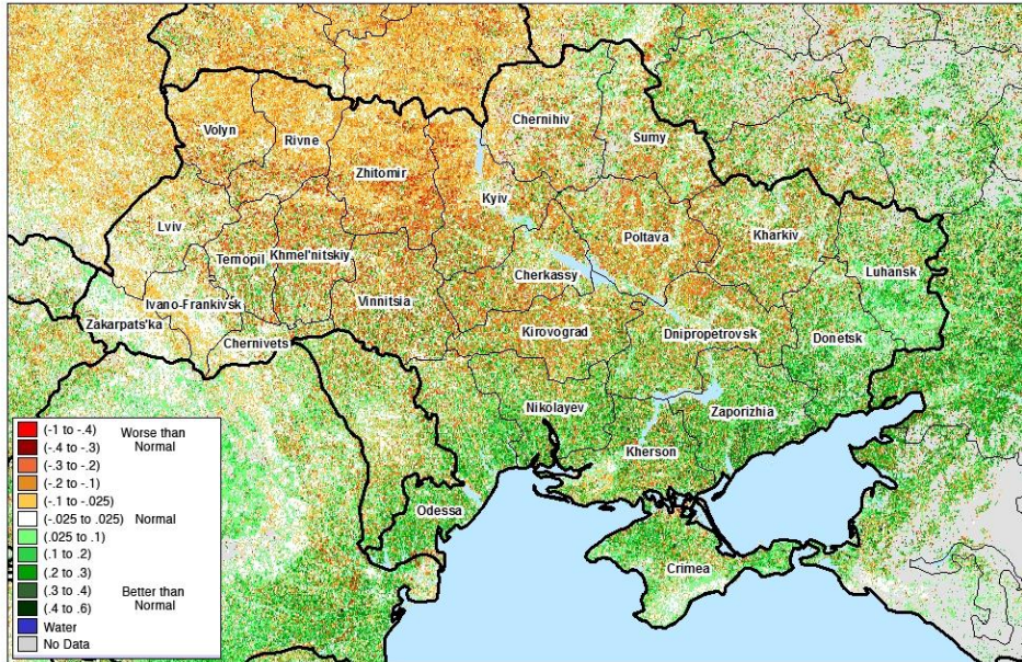
Ukraine: MODIS NDVI Anomaly Departure from Average May 17-24, 2017

throughout the central-north and west, which indicates worse than normal vegetative growth in those regions of Ukraine.