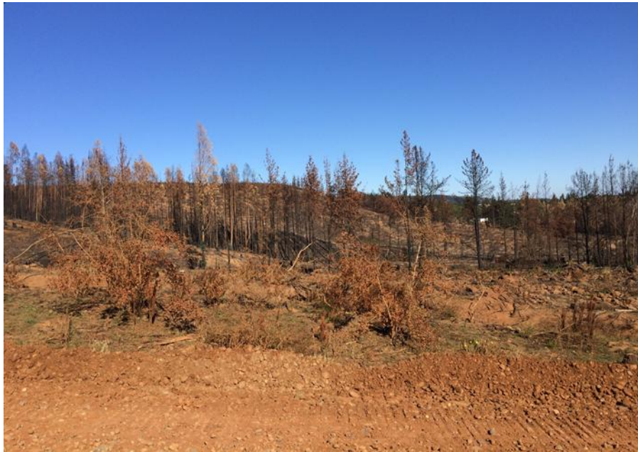
Burned forestry plantations on April 29, 2017