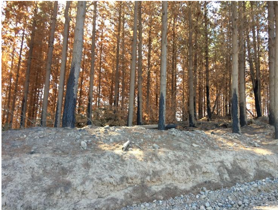
Damaged forest plantation in Constitución, Maule Region on April 29, 2017