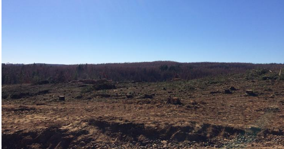
Burned forest in Constitución, Maule Region on April 29, 2017. The local company harvested the remaining lumber after the wildfire.