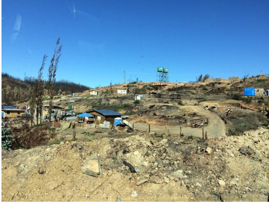
The town of Santa Olga on April 29, 2017