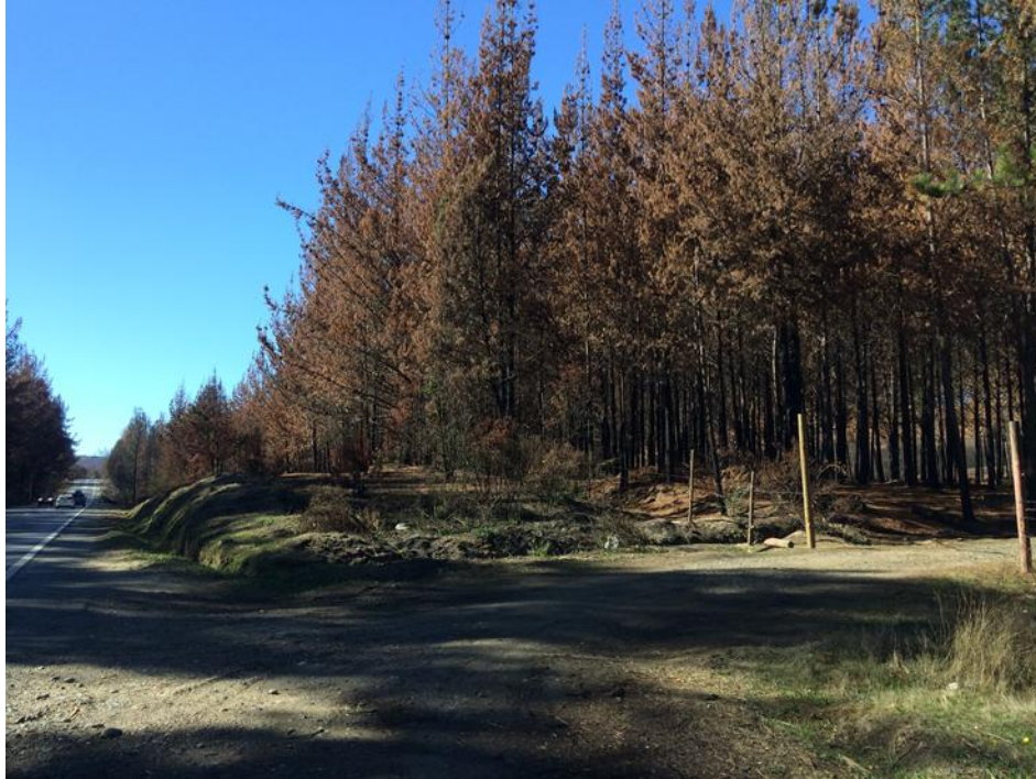
Damaged forest next to the main road that leads to Constitucion, Maule Region on April 29, 2017